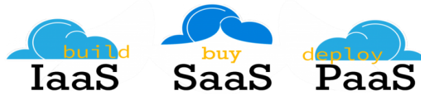
Fig. 2 Models of cloud services

Cloud Serviced is divided into three categories i.e. Infrastructure as a Service (IaaS).Software as a Service (SaaS), and Platform as a Service (PaaS).