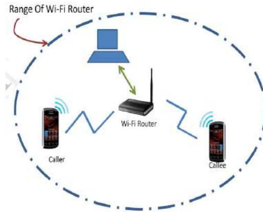
Fig.1. Range of WiFi