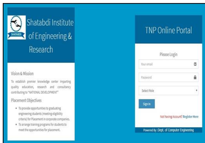
Fig. 2. Home Page