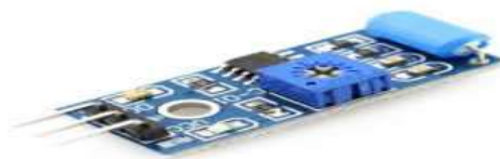
Fig.4- Vibration Sensor

The ADXL103 is a high performance, single-/dualaxis accelerometer compatible with Sn/Pb- and Pb-free solder processes. The bandwidth is selected based on the application ranging from 0.5 Hz to 2.5 kHz. Capacitor CX and Capacitor CY at the XOUT and YOUT pins