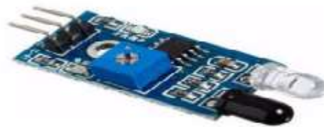
Fig 3. – IR Sensor

This sensor is used to detect the obstacles by transmitting continuous IR rays and receiver receiving the IR light back and later measuring the voltage based on the amount of reflected light received. The wavelength region of 0.75\mu\text{m} to 3\mu\text{m} is called near infrared, the region from 3\mu\text{m} to 6\mu\text{m} is called mid infrared and the region higher than 6\mu\text{m} is called far infrared. Figure 5 represents the infrared radiation sensor.